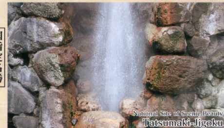
National Site of Scenic Beauty Tatsumaki-Jigoku

Tatsumaki-Jigoku, a geyser, is a natural monument designated by Beppu City. The word "Geyser" means a hot spring spouting out boiling water and steam in intervals. This particular spa appears in the limelight among the world's geysers due to the short intervals between spouts.