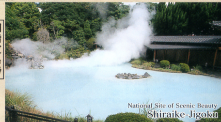
National Site of Scenic Beauty Shiraike-Jigoku

The White Pond Hell is so called because the colorless water that naturally spouts from the ground mysteriously turns creamy white. The serene atmosphere of the traditional Japanese garden is sure to soothe your mind